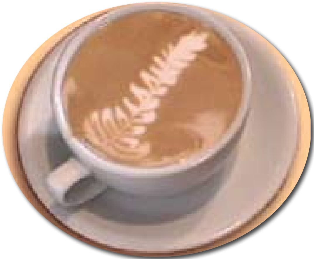
Organic Roasted Coffee